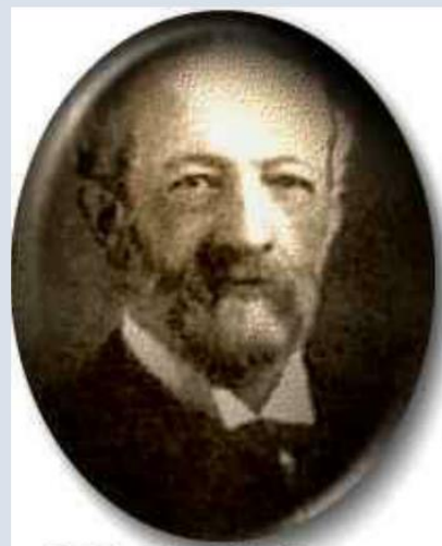
Sir Robert Anderson 1841-1918

360 Days is the Biblical or Prophetic Year used by noted evangelical scholar and Scotland Yard Inspector, Sir Robert Anderson. Using this 360 day year he was able to lay out a superbly accurate timeline for the first 69 weeks of Daniels Seventy Week prophecy.